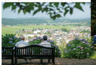
Hydrangea and Mitsuke cityscape