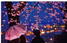
Illuminated Cherry Blossoms at night are fantastic.