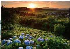
10,000 hydrangeas blooming in the morning sun