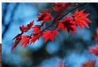
Autumn leaves woven by deciduous trees