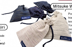
Mitsuke Weave Pouch

Healthy sweets made with soybean flour. (Sato Confectionery)