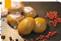
Kokuto Manju (Brown sugar confectionery) Mitsuke

It has been loved for many years for its chewy texture and gentle sweetness. (Confectionery Tanokuchiya)