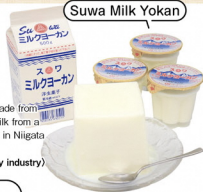
Suwa Milk Yokan

Milk agar made from fresh raw milk from a dairy farmer in Niigata Prefecture. (Suwa dairy industry)