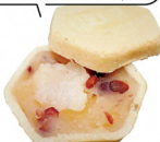
Tako Monaka (Wafer cake filled with bean paste)

A rice cake filled monaka with a motif of a hexagonal kite from a Big Kite Battle. (Tomariya Confectionery)